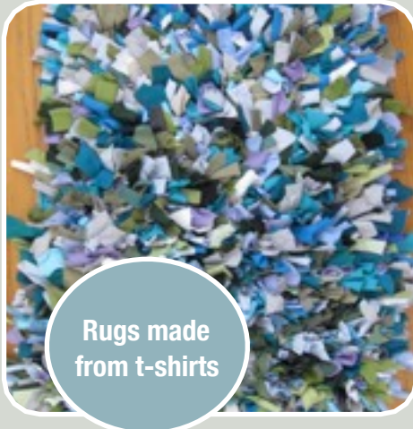
Rugs made from t-shirts

Taking donated items and turning them into a treasure through painting, styling, repurposing items.